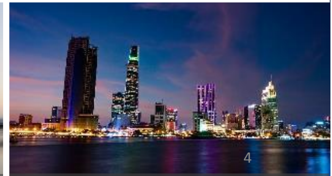
Ho Chi Minh City