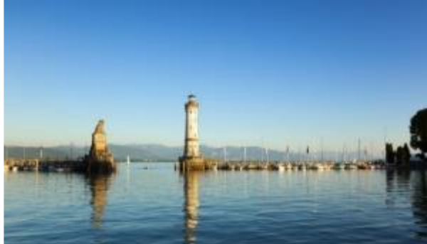
Lindau - Head Office